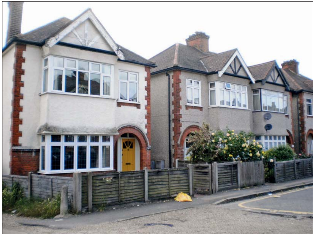
Lot 17 - 1/3 Dunton Road, Romford, Essex