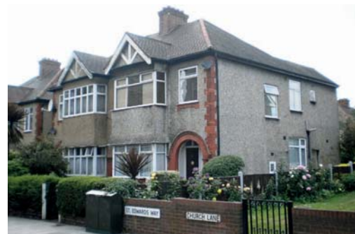
Lot 19 - 2/2A, 6/6a, 10/10A, 12/12A, 14/14A, 16/16A & 18/18A St Edwards Way, Romford, Essex