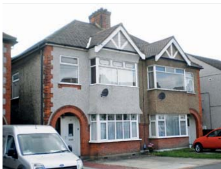
Lot 17 - 5-11 & 15-17A Dunton Road, Romford, Essex