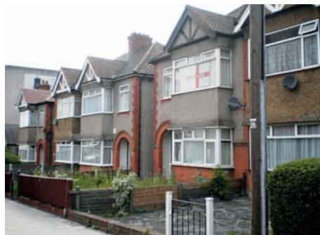
Lot 19 - 2/2A, 6/6a, 10/10A, 12/12A, 14/14A, 16/16A & 18/18A St Edwards Way, Romford, Essex