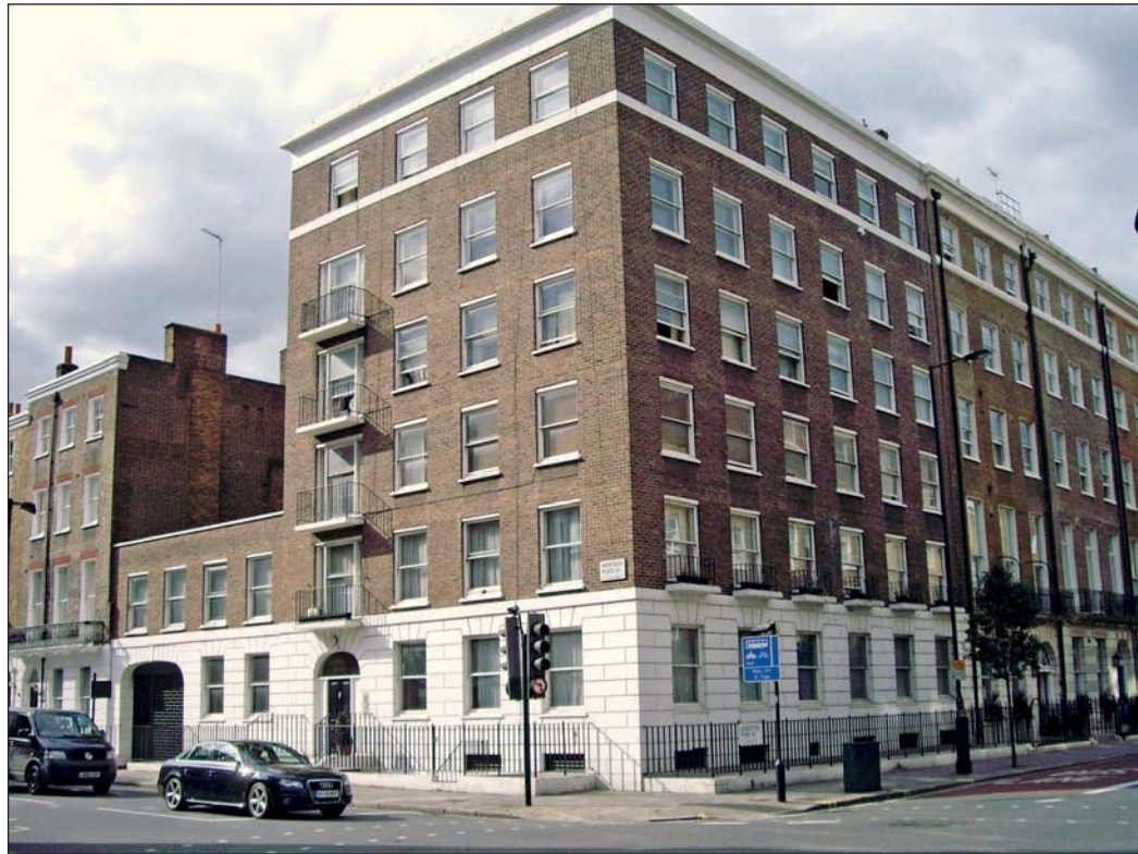
All Library Photographs