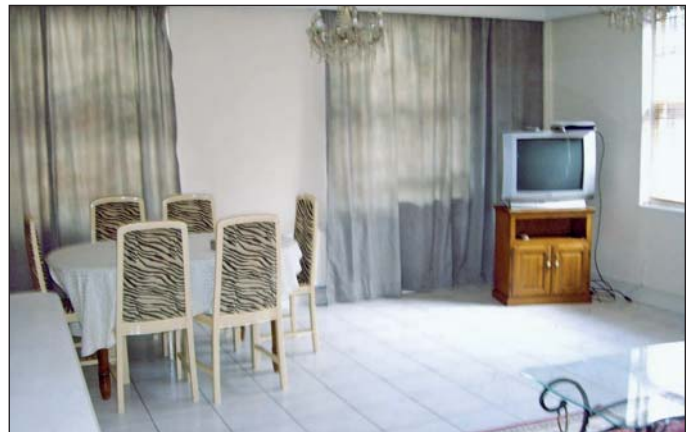
Flat 6 - Living Room