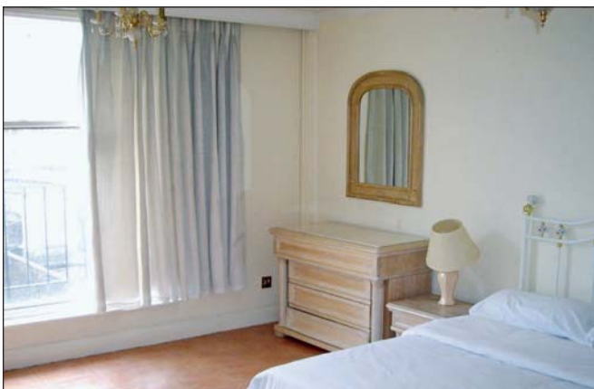
Flat 6 - Bedroom